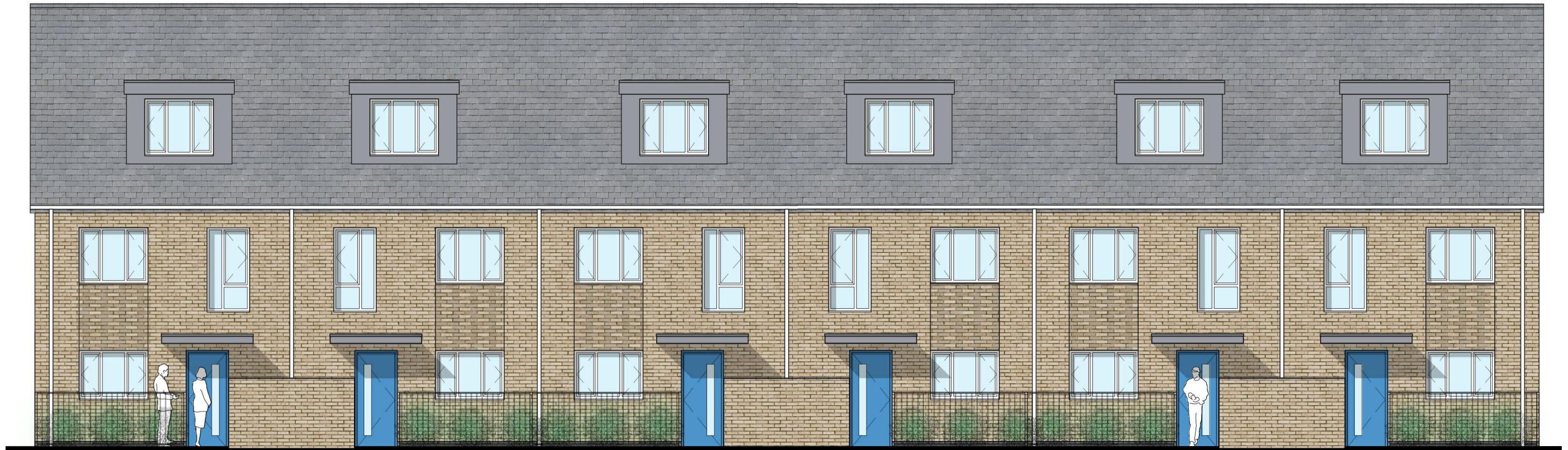
Houses Front Elevation