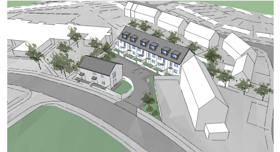
Aerial North View.