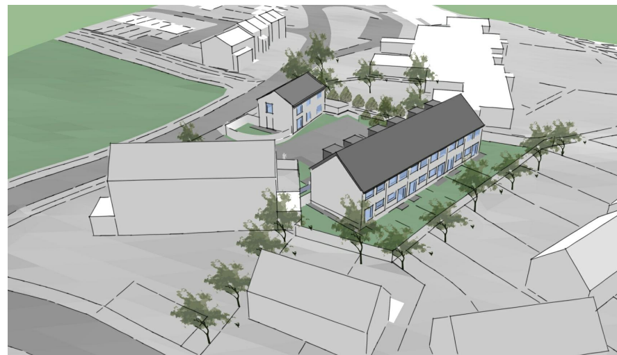
Aerial West View.