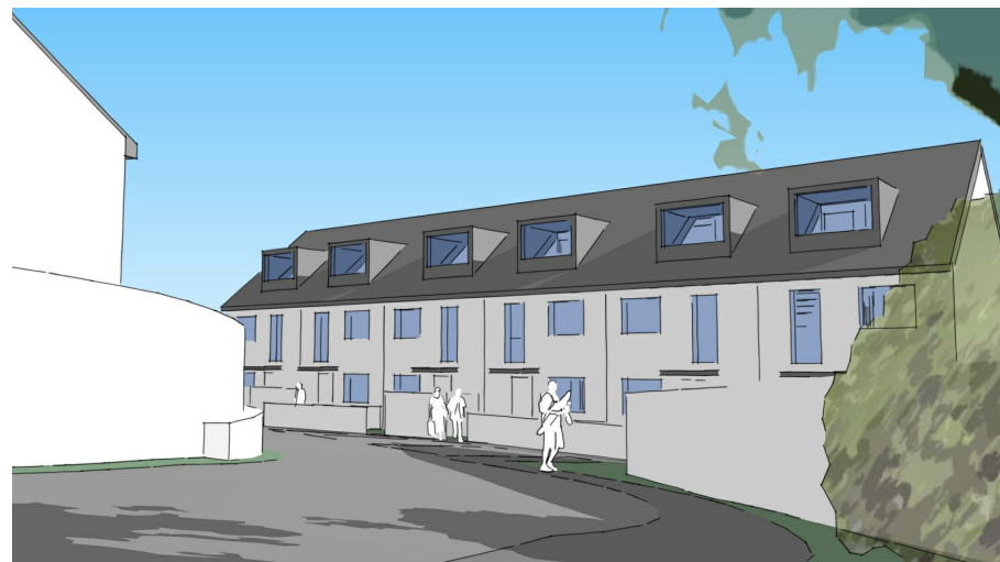
Street North View.