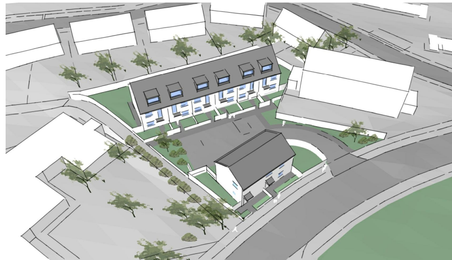
Aerial North View.