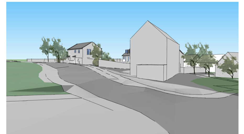
Street West View.