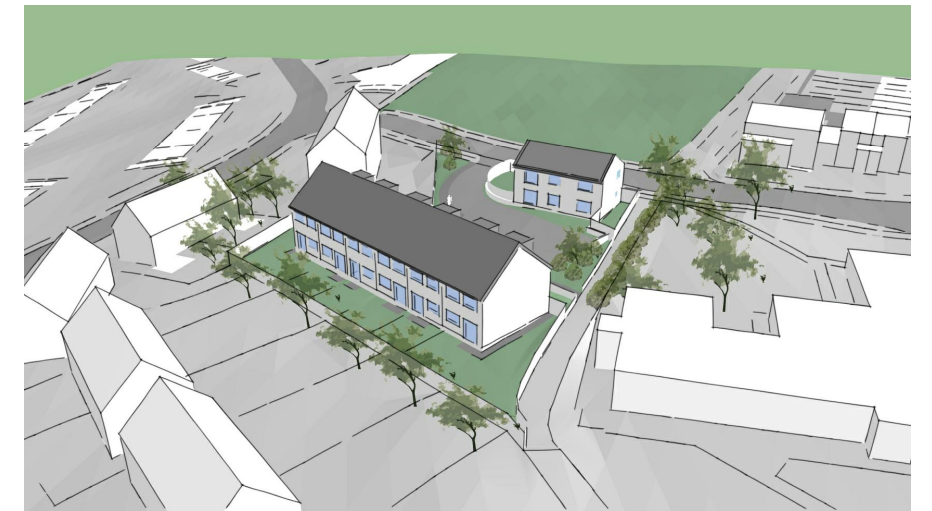
Aerial South View.