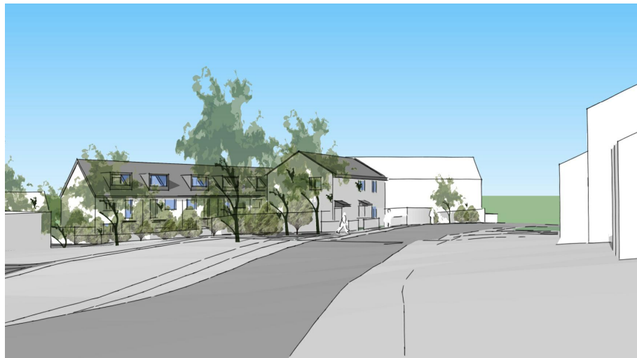
Street East View.