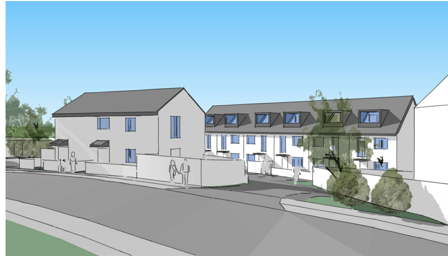
Street North View.

The scale of the buildings work contextually, with a mixture of 2-3 storey buildings of similar heights surrounding the development.